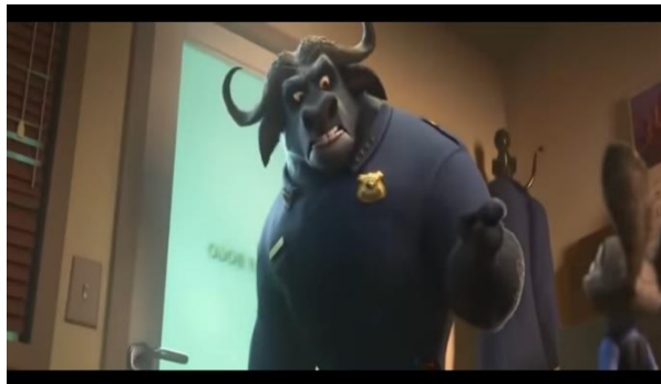
Figure 4.12. Zootopia movie, 2016;(00;31;56)

Chief Bogo : “You’re fired. Insubordination!. I will give you 48 hours”