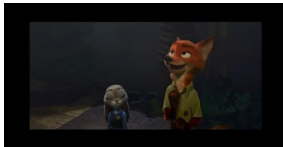
Figure 4.6. Zootopia movie, 2016; ( 00:55:22)

Nick : “Uh, no. Sorry. What I said was, "no."She will not be giving you that badge. Look, you give her a clown vest. and a three-wheeled joke-mobile. and two days to solve a case. you guys haven't cracked in two weeks?. Yeah. It's no wonder she needed to get help from a fox. None of you guys were gonna help her, were you?. Ho. Here's the thing, Chief. You gave her the 48 hours. so, technically, we still have. 10 left to find our Mr. Otterton. and that is exactly what we're gonna do. So, if you'll excuse us. we have a very big lead to follow and a case to crack. Good day. Officer Hopps.”