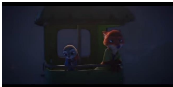
Figure 4.4. Zootopia movie, 2016; (00;56;36)

Nick : “Never let them see that they get to you. No, I mean, not anymore... but I was small... and emotionally unbalanced like you