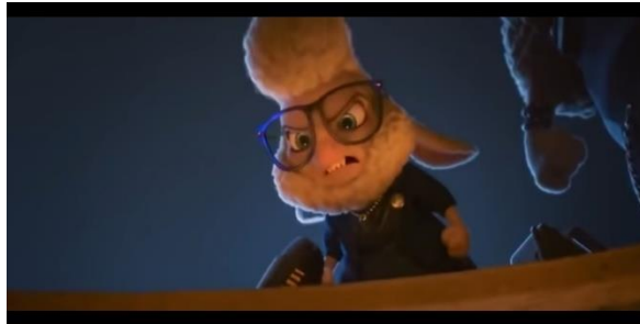
Figure 4.3. Zootopia movie, 2016; (01;28;49)

Bellwether: “Well, you should have just stayed. on the carrot farm, huh? It really is too bad. I did like you. No, of course not. He is. Yes, police! There's a savage fox. in the Natural History Museum. Officer Hopps is down! Please, hurry. Oh, but he can't help it, can he? Since preds are just biologically predisposed to be savages. Gosh. Think of the headline! "Hero cop killed by savage fox." Yeah, pretty much. Fear always works. And I'll dart every predator. in Zootopia to keep it that way. Bye-bye, bunny. What? I framed Lionheart. I can frame you, too. It's my word against yours.”