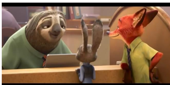
Figure 4.8. Zootopia movie, 2016; (00;40;35)