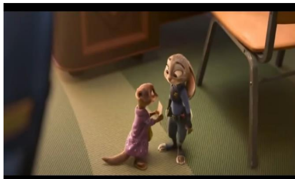
Figure 4.1. Zootopia Movie, 2016; (00.30.36)

Mrs. Otterton : "My husband has been missing for 10 days. His name is Emmitt Otterton. He's a florist. We have two beautiful children. He would never just disappear. Please, there's got to be somebody to find my Emmitt. "