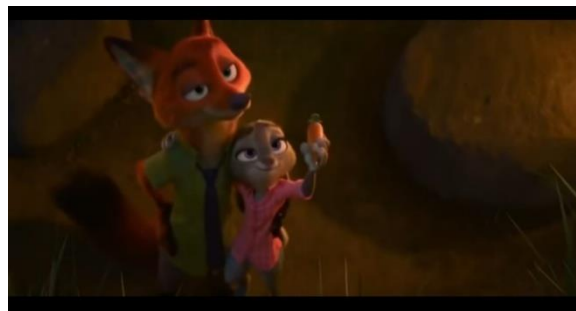
Figure 4.9. Zootopia movie, 2016;(01;30;48)

Nick : “Besides, I think we got it. I think we got it. You laid it all out beautifully.”