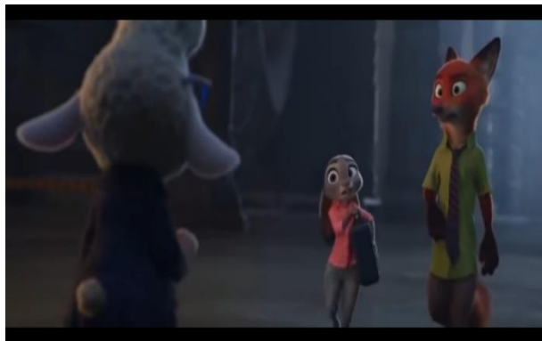
Figure 4.2. Zootopia movie, 2016; (01;26;55)

Bellwether : “Judy!. I’m so proud of you, Judy. You did just a super job! I’ll go ahead and I’ll take that case now. Get them”