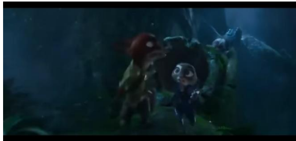
Figure 4.3. Zootopia movie, 2016; (00;52;37)

From the explanation and the scene above, the researcher concludes that Manchas also fulfill the constituent of a Villain in the Zootopia Movie. Chasing and attacking Nick and Judy are the action shows in the movie that Manchas also The Villain of the story.