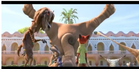
Figure 4.7. Zootopia movie, 2016; (00;37;59)

Judy: Uh.You didn't happen to catch. the license plate number, did you?