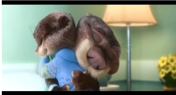
Figure 4.11. Zootopia movie, 2016; (01;31;34)

Mrs. Otterton asks Judy to find her husband and it became what The Hero lacks. When Judy finally finds Mr. Otterton that has been missing it becomes the prize or The Princess in the Zootopia movie. The Princess is not always a woman and in fact The Princess is not always human, The Princess is whatever The Hero lacks.