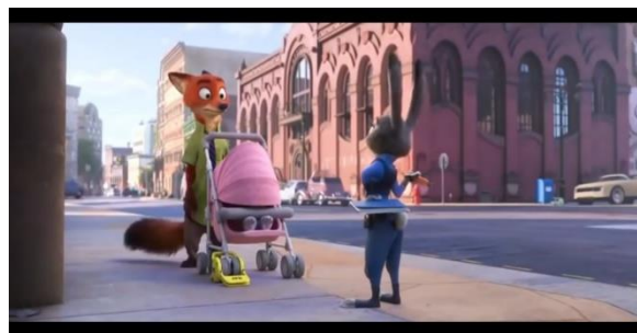
Figure 4.5. Zootopia movie, 2016; (00;34;50)

Judy : "Hi! Hello? It's me, again! No. Actually, it's Officer Hopps. and I'm here to ask you some questions about a case. This is important, sir. I think your $10 worth of popsicles can wait. Please, just look at the picture. You sold Mr. Otterton that Popsicle, right? Do you know him? Fine. Then we'll have to do this the hard way. Nicholas Wilde, you are under arrest. Felony Tax Evasion. I mean, I am just a dumb bunny. but we