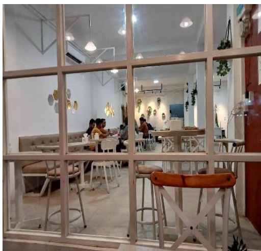
Figure 3. One of the Air-Conditioned Coffee Shops in Banda Aceh City

Cigarette advertisements in coffee shops are certainly mutually symbiotic between coffee shop owners and cigarette companies. The cooperation scheme, where cigarette companies compensate coffee shop owners and coffee shop owners, is very important to increase income for its business continuity is to pay employee salaries, taxes and others. However, a modern coffee shop, namely the existence of an air-conditioned room, is a capital that can be related to KTR because indirectly the coffee shop owner prohibits people from smoking in an air-conditioned room.