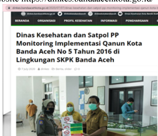
Figure 1. Form of Work Efforts Monitoring KTR

Based on the results of an interview with the Head of the Health Office of Banda Aceh City (kadinkes) that the Qanun of Banda Aceh City number 5 of 2016 concerning KTR has been maximally socialized since the existence of the Qanun until 2018, but in 2019 it has been limited due to the Covid-19 Pandemic. Socialization by using attributes of no smoking or the dangers of smoking is carried out in general other than government agencies, namely in public places such as ports, terminals and highways without being devoted to coffee shops with the assumption that coffee shops are also public places that are included in the port, for example, there must be coffee shops or coffee shops. In 2020 together with NGOs, namely the Aceh Institute, the Health Office and Satpol PP Monitoring the Implementation of Banda Aceh City Qanun No. 5 of 2016 in the SKPK Banda Aceh Environment. This can be seen in the picture below contained on the website https://dinkes.bandacehkota.go.id/