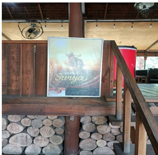
Figure 2. Cigarette Advertisements in Coffee Shops in Banda Aceh City

In addition to interviews, observations found that there are still many coffee shops that directly advertise cigarettes such as billboards, ashtrays, and attributes supported by cigarette companies.